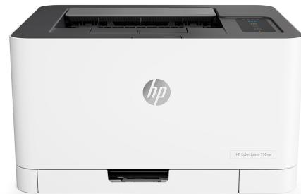
HP Color Laser 150nw

Dynamic security enabled printer. Only intended to be used with cartridges using an HP original chip. Cartridges using a non-HP chip may not work, and those that work today may not work in the future. Learn more at: http://www.hp.com/go/learnaboutsupplies