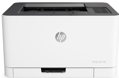
HP Color Laser 150a

Get productive print performance – world's smallest colour laser in it's class. 1 Print, and scan, produce high-quality colour results, and print and scan from your phone. 2